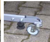
Foldable rolls-set (option)