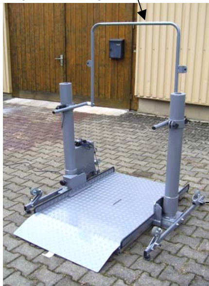
Safety stirrup foldable, adjustable height