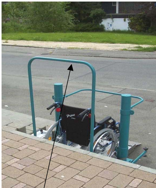
Locking stirrup for protection of the access above (option)